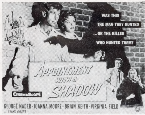
22 x 28